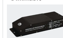
TRE24L40DC Max. recommended load: 36W; Min. recommended load: 8W; 6.77" x 2.67" x 1.26" (171 x 68 x 32mm)