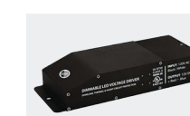
TRE24L96DC Max. recommended load: 90W; Min. recommended load: 8W; 6.77" x 2.67" x 1.26" (171 x 68 x 32mm)