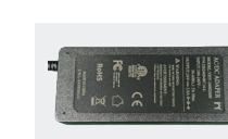
PGID2448/ PGID2496 Plug-in Driver