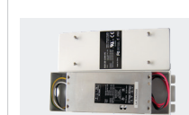
LEDDR-24-120W Indoor/Outdoor driver Max. recommended load: 90W; 10" x 3 3/8" x 3 3/16" (254 x 85.7 x 80.9mm)