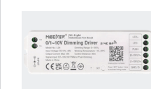
CNTRL-0-10V-DIM 0/1-10V Dimming Controller